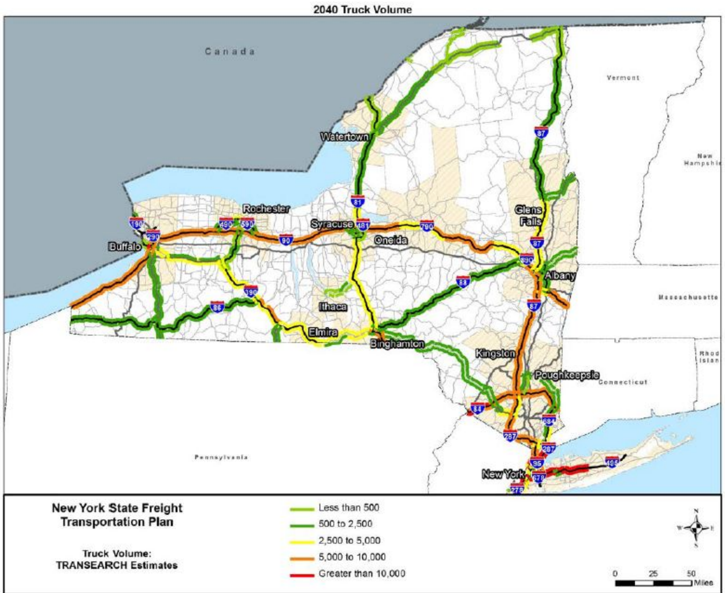
Figure 7-3: 2040 Truck Volume Map, TRANSEARCH Data (Daily Volumes)